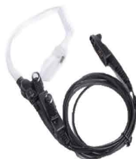
EA001 PTT earphone