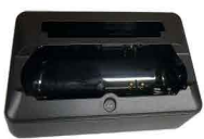
DC900 desktop charger