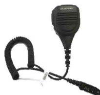
MIC002 speaker MIC